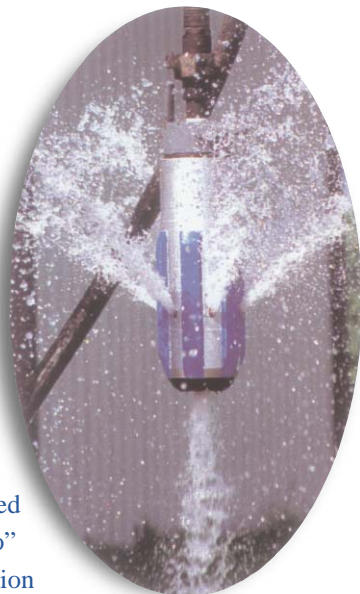
Centralized "Tornado" Up-Jet Action

Since Ray Oil Tool Company introduced Solid Casing Centralizers in 1984, they have become the most profitable well equipment run in the wellbore today. Profits which are realized from achieving a good primary cement job every time.